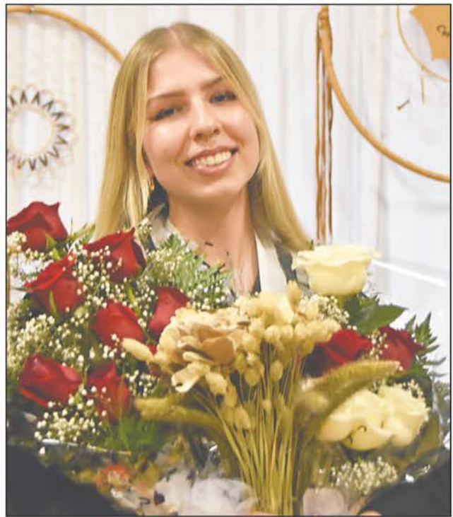
Valedictorian presented with flowers