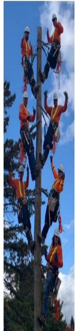
2019 Line Crew Graduates